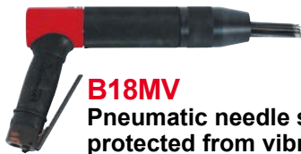
B18MV Pneumatic needle scaler, protected from vibrations Part no.: 6151740520