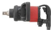
CP6920-D24 Pneumatic 1" impact wrench