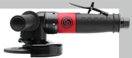
CP3550-120AA5 Pneumatic angle grinder