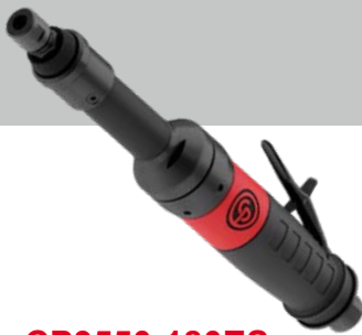
CP3550-180ES Die Grinder

You can find more information about our products and metalworking solutions at: tools.cp.com