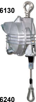
CP9968 Spring balancer for CP6240 load range 55-65 kgg