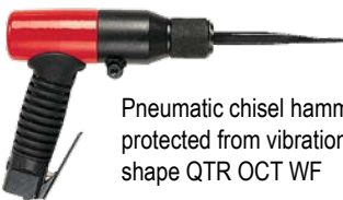
B19B Pneumatic chisel hammer Part no.: 6151740300

Pneumatic chisel hammer protected from vibrations, shape QTR OCT WF