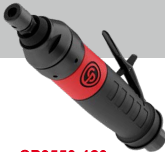
CP3550-120 Die Grinder