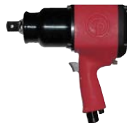
CP0611P-RS Pneumatic 1" impact wrench