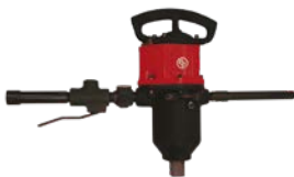
CP6130-T70 Pneumatic 1 1/2" impact wrench